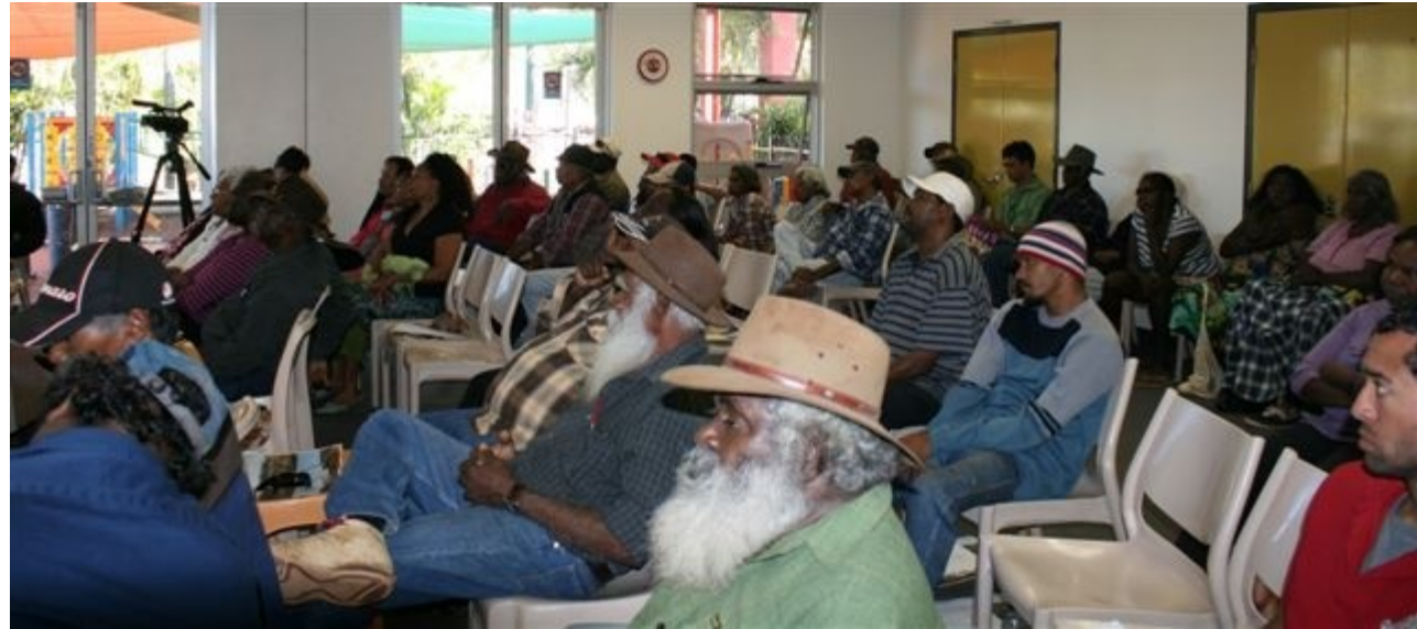
Community Meeting - KLC