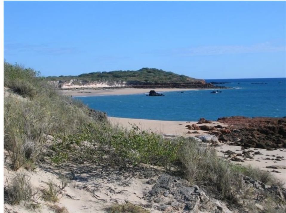
James Price Point, Dampier Peninsula